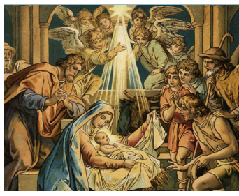
December 26<sup>th</sup>: The Feast of St. Stephen January 1<sup>st</sup>: New Year's Day